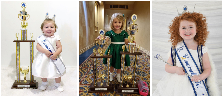
Cover Girl Sash, crown